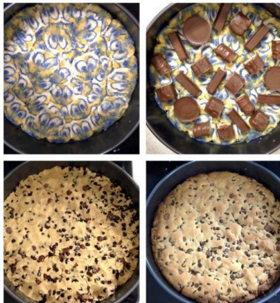
happyhooligans.ca minions COOKIE-CANDY-BAR-PIE